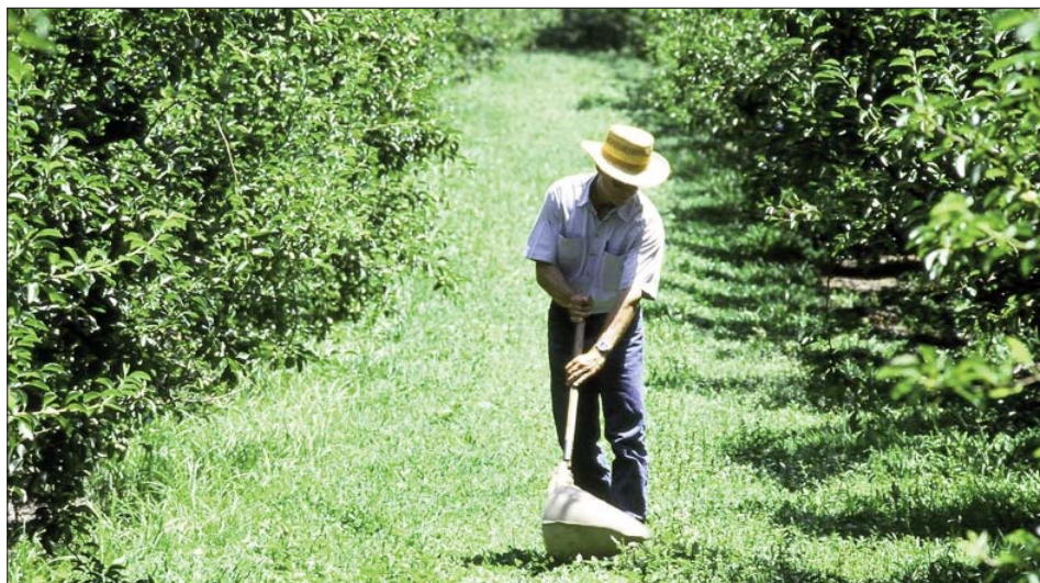
Scouting for pests and beneficials in a biointensive IPM orchard system

In the mid-1980s the seed and pesticide industries took advantage of the emerging tools of molecular biology to create transgenic plants expressing genes capable of the systemic production in plant cells of Bacillus