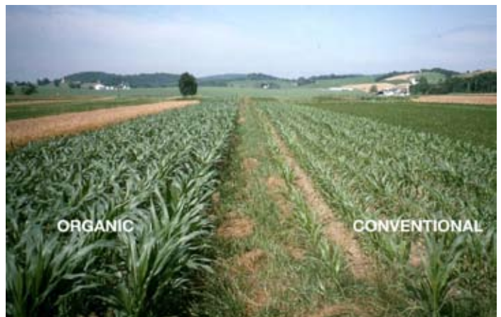
Better water infiltration, retention and delivery to plants helps to sustain yield during drought.

The same study reports that corn and soybean returns from organic systems at the Neely-Kinyon Long-Term Agroecological Research site in Iowa, measured over a three-year period, were significantly greater than returns in conventional corn and soybean crop rotations. The organic rotations were more economical even when market-based organic premiums were excluded from the analysis. "Returns to land, labor, and management were higher in the organic rotations regardless of whether an organic price premium was received or not." (Delate et al. 2003)