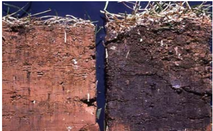
Chemically depleted soil on the left VS nutrient-rich organic soil on the right.

Analysis of the nation's oldest continuous cropping test plots in Illinois shows that, contrary to long-held beliefs, nitrogen fertilization does not build up soil organic matter. (Khan 2007) Plant fertility science expounded by organic farmers and researchers emphasizes the entirety of the soil – rather than simple chemical salts.