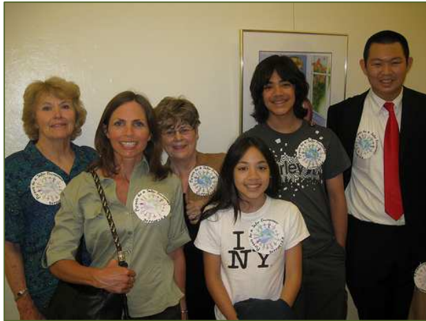
Members of Parents for a Safer Environment who worked with school officials to pass a successful Integrated Pest Management Policy.