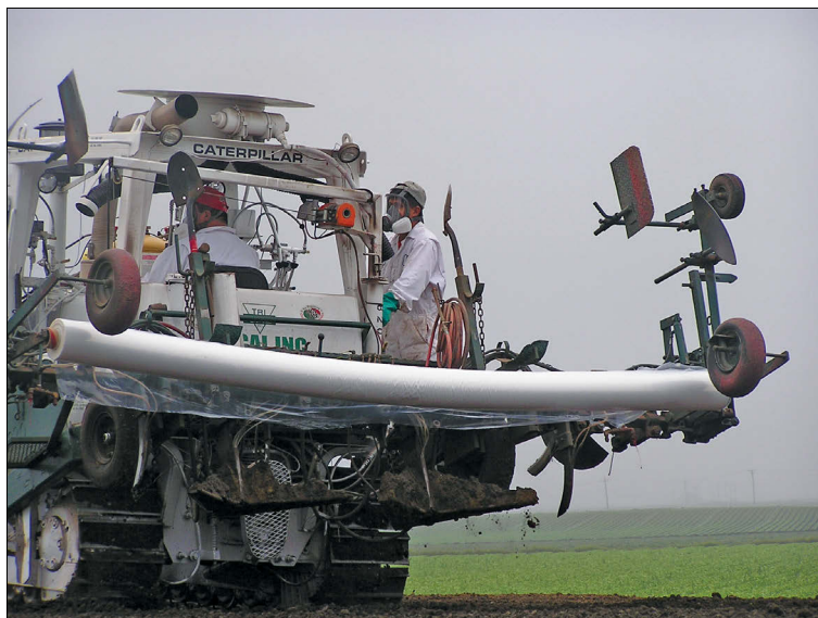
Too close for comfort: Just a few feet from homes and schools in rural California, applicators fumigate the soil.

Latino schoolchildren bear the greatest brunt of pesticide exposure. Seven of the top ten counties with heaviest use of pesticides within ¼ mile of schools are in the San Joaquin Valley. While Latinos comprised 54% of the student population in the 15 counties, Latinos were 46% more likely than white students to attend schools with use of highly hazardous pesticides within ¼ mile and 91% more likely to attend schools with the highest use of highly hazardous pesticides. In April 2011, the U.S. Environmental Protection Agency issued a finding of