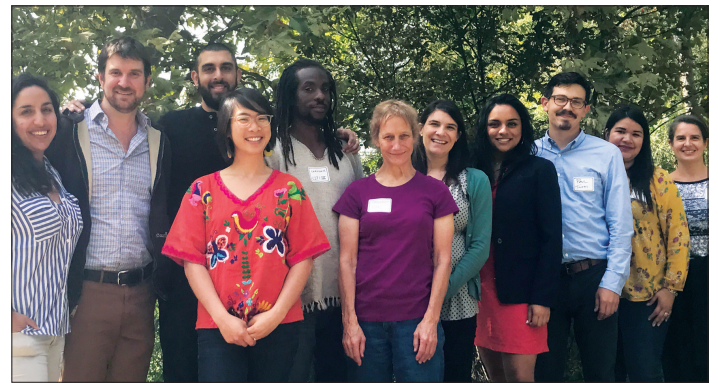
California Farmer Justice Collaborative members celebrate the Farmer Equity Act