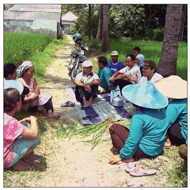
Indonesian Field School farmers discuss the ecological management of insect pests found in their paddy fields.

Collaborative structures that emphasize co-learning, social networks of innovation, and building capacity in flexible place-based decision-making have proven more effective than conventional top-down transfers of technology in the developing world. Partnerships that focus on inclusion and meaning-