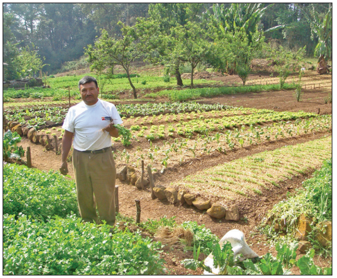
An organic farmer in Mexico practices crop rotation, applies mulch for weed control, uses organic fertilizers and maintains an agroforest to protect local springs that provide clean irrigation water.

Similarly, a comprehensive examination of nearly 300 studies worldwide by the University of Michigan concluded that organic agriculture could produce enough food, on a per capita basis, to provide 2,640 to 4,380 kilocalories per person per day (more than the suggested intake for healthy adults). Organic farms in developing countries were found to outperform conventional practices by 57%. These promising findings may underestimate the full potential of agroecological farming to contribute to increased farm-level productivity, household income and food security, as only a very small