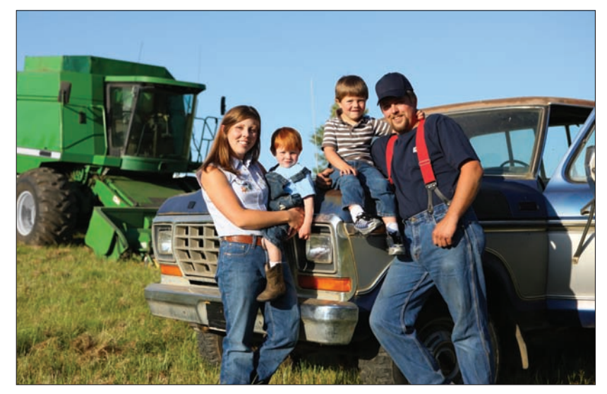
Decisive action to re-balance power in the food system and to establish fair, vibrant and sustainable localized food systems can help feed the world, sustain family farmers, give people jobs with living wages, and protect the health of children, rural communities and future generations.