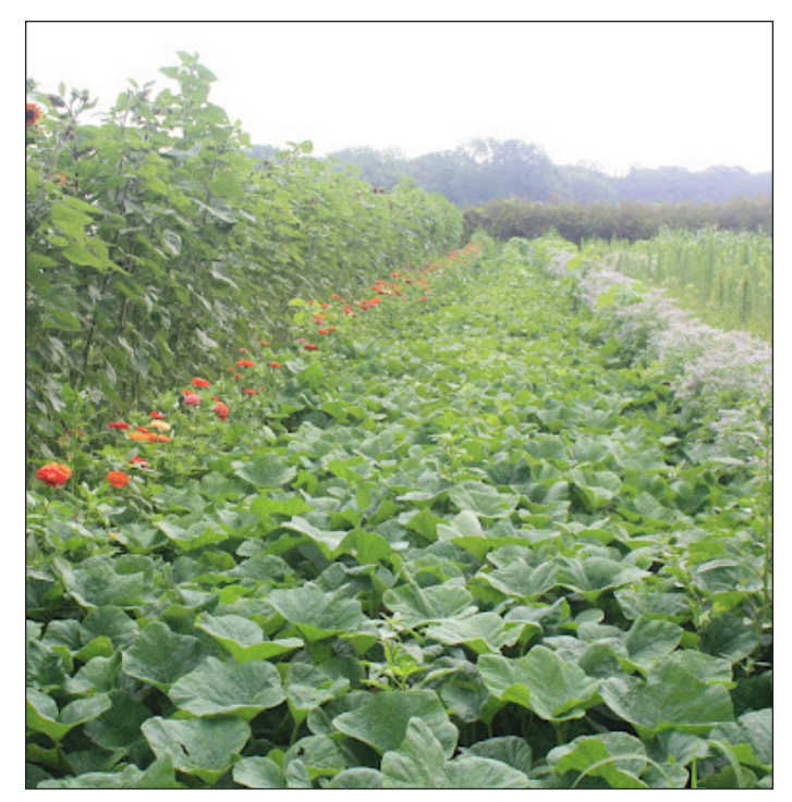
Research shows that intentional diversity in cropping systems can provide natural pest control, improve soil health, decrease weed biomass, attract beneficial organisms, and improve overall production.

While the use of genetically-engineered (GE) crops is often touted as a tool for pesticide reduction, <sup>36</sup> scientific research shows the opposite to be true. <sup>37</sup> GE crops are often crops that have been genetically modified to be resistant to a specific pesticide, so that farmers may apply the pesticide and kill or control surrounding pests without damaging their crop. However, the widespread adoption of GE crops has led to the emergence of herbicide-resistant weeds, causing farmers to apply more herbicides. <sup>37</sup> For instance, in the United States, the introduction and widespread planting of herbicide-resistant crops led to an increase of 527 million pounds (239,000 tonnes) of herbicide use from 1996–2011, and caused an overall 7% increase of herbicides and insecticides. <sup>37</sup> The use of glyphosate (the active ingredient in Roundup —